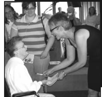
Jamie Lee Curtis, featured speaker for a Women's Health Week event greets attendees after the program.