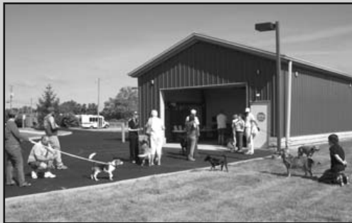
Dogs and their owners wait in line at a rabies clinic held in the health department garage. There were 118 animals vaccinated at the clinic which was a collaborative effort between the health department and the Knox County Humane Society.

► Flu shots were available daily on a walk-in basis in the medical clinic, in addition to five community clinics and a drive-thru clinic. Even with the availability of flu shots at various other outlets in the community, the health department continues to be the main provider of flu shots in the county, administering 2,764 shots in 2008.